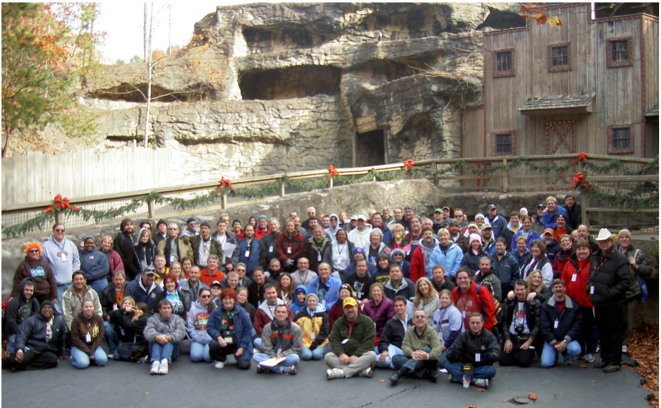
Coasterfest—Dollywood—November 17, 2007