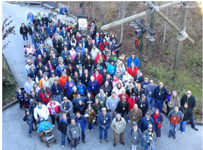
Event attendees pose for a group photo before heading off to ride!

To all of those who made it down to our neck of the woods for the event, I am certain you had a great time. To those of you that have never been or are debating on attending one year, I would suggest you marking your calendars for what has become a must-do event for everyone in the club. With the success of Dollywood's 2012 season and our Smoky Mountain Coasterfest event, we honestly can't wait to see what 2013 will bring to the park (and to us)!