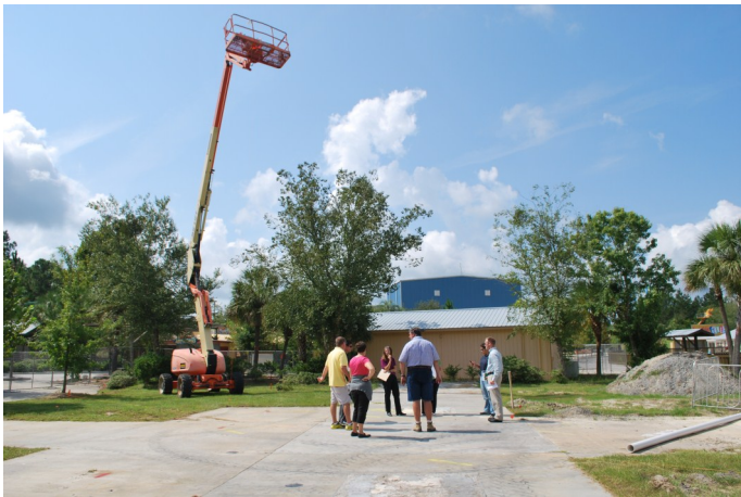
The man lift shows where the highest point of TailSpin will be!