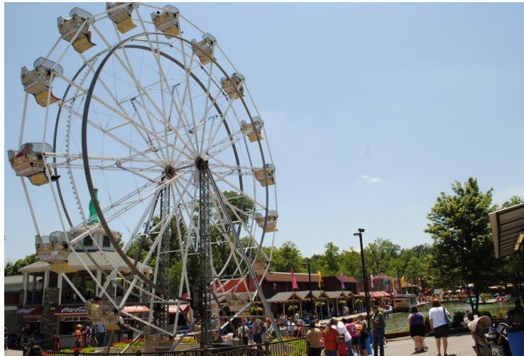
A picturesque Lake Winnie awaited ACEer's on a beautiful day!