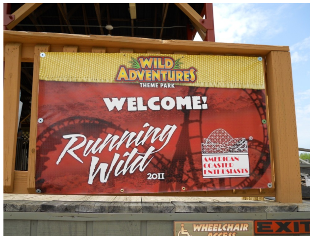
Wild Adventure's was ready and waiting when we arrived!