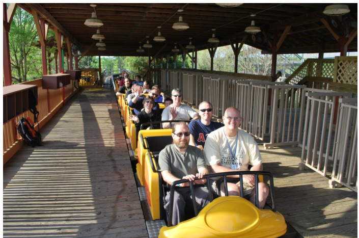
The Running Wild attendees are ready to ride a renovated Cheetah!