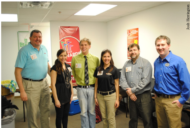
Representatives from Alabama Adventure, Wild Adventures, Dollywood & Six Flags Over Georgia were all on hand to showcase their parks!