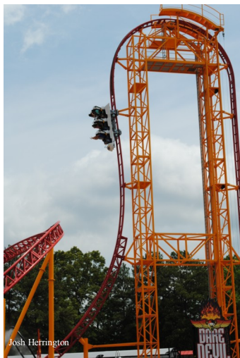
ACEer's enjoying the first ever ERT session on Dare Devil Dive!