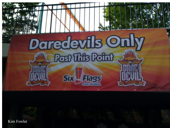
You heard 'em. Daredevils only!