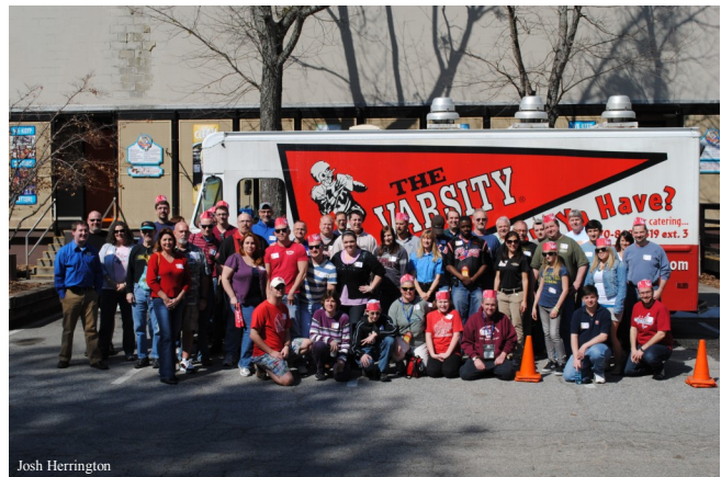
ACEer's pose for a group photo after an All-You-Can-Eat Varsity meal!