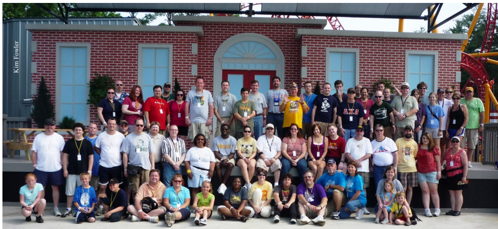
Spring Fling attendees take a break and pause for a quick group photo.

Special thanks to the entire Six Flags Over Georgia crew for pulling off another great Spring Fling!!