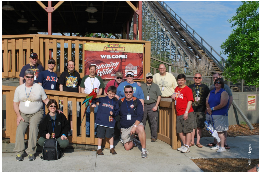
The Running Wild attendees are ready to ride!

I would like to thank everyone at Wild Adventures for putting together such a fantastic event. I would also like to implore all ACE members to really think about coming to this great event in 2012!