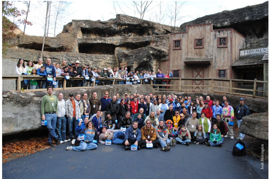
The group gathers at Blazing Fury for the group photo before being released upon the park!

When darkness begins to fall in the hills of the Smokies, Dollywood becomes a Christ-