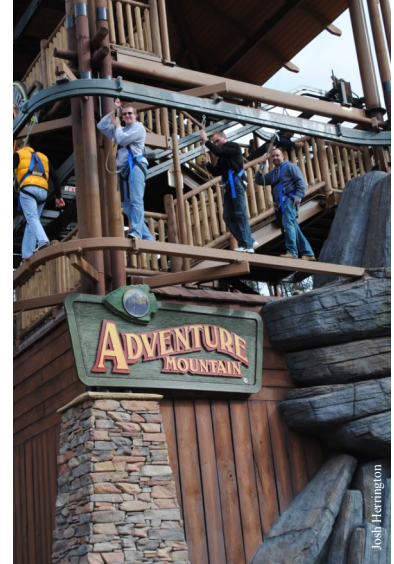
ACE'ers enjoy Adventure Mountain

Overall it was a wonderful event to be a part of and the general consensus was all who came had a great time. What better way to get someone in the Christmas spirit than to come to Dollywood for Christmas in the Smokies. The icing on the cake was being with fellow ACE'ers and having an amazing time. Make sure if you did not come this year you mark your calendars. Smoky Mountain CoasterFest is November 19, 2011, and we're already thinking about ways to make it even better.