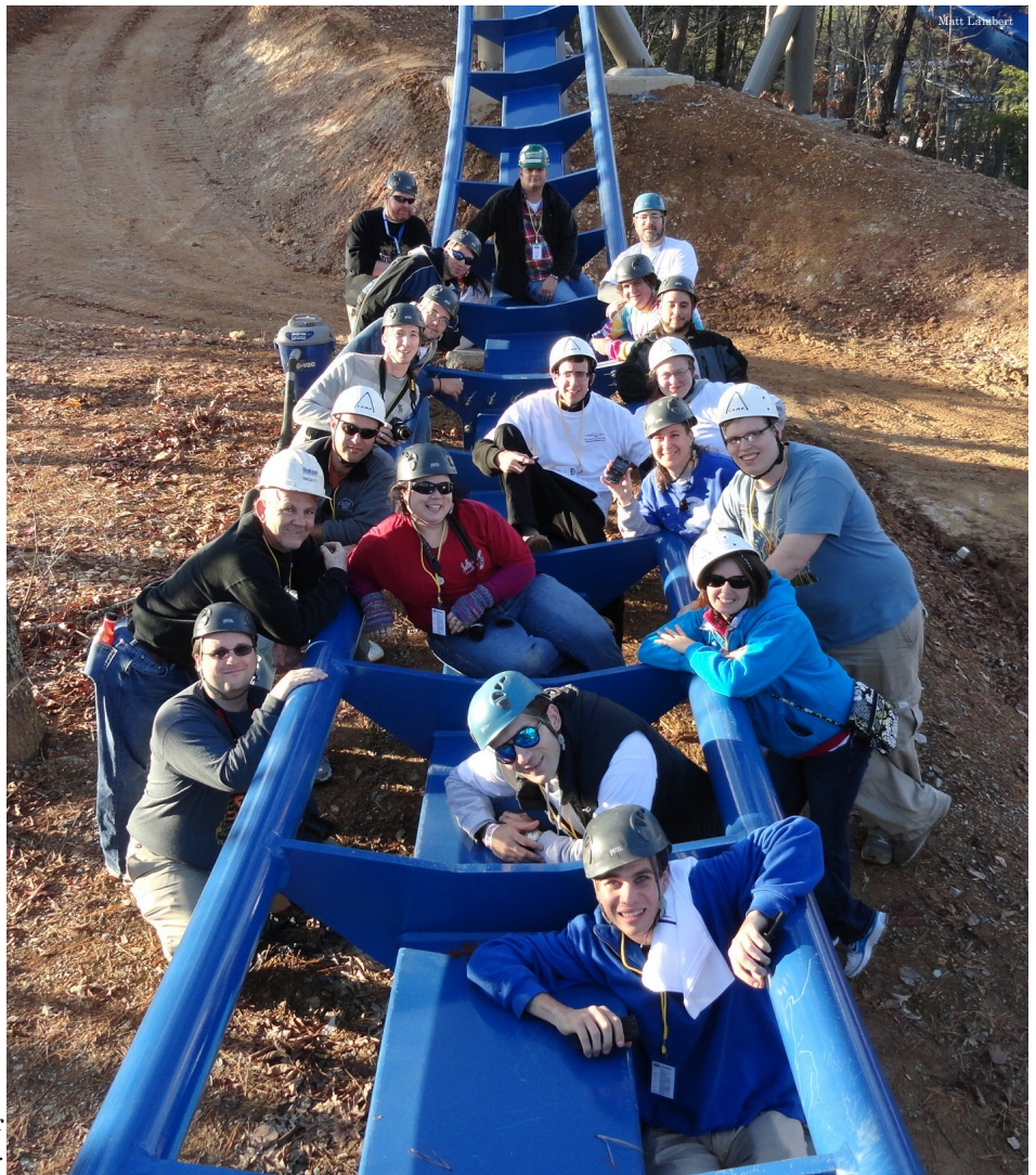
The Wild Eagle Construction Tour winners show Wild Eagle some love.

As the event came to a close, everyone left with an anticipation of what is to come next year. We are already in the thought planning stages of what could be done next year to improve the event and maybe a little ERT on a coaster called Wild Eagle at night could help with that. We hope to see everyone next year at Smoky Mountain CoasterFest on November 17, 2012 at Dollywood.