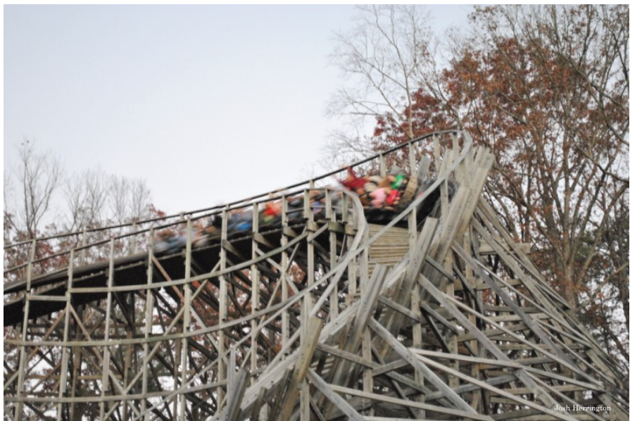
Thunderhead was running spectacular throughout the day making our evening ERT session insane!!