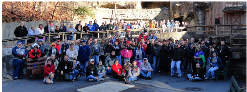
Everyone poses for the group photo before being unleashed on the park!