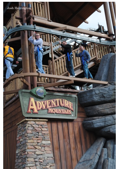
Adventure Mountain was showing attendees how to have fun while exercising!